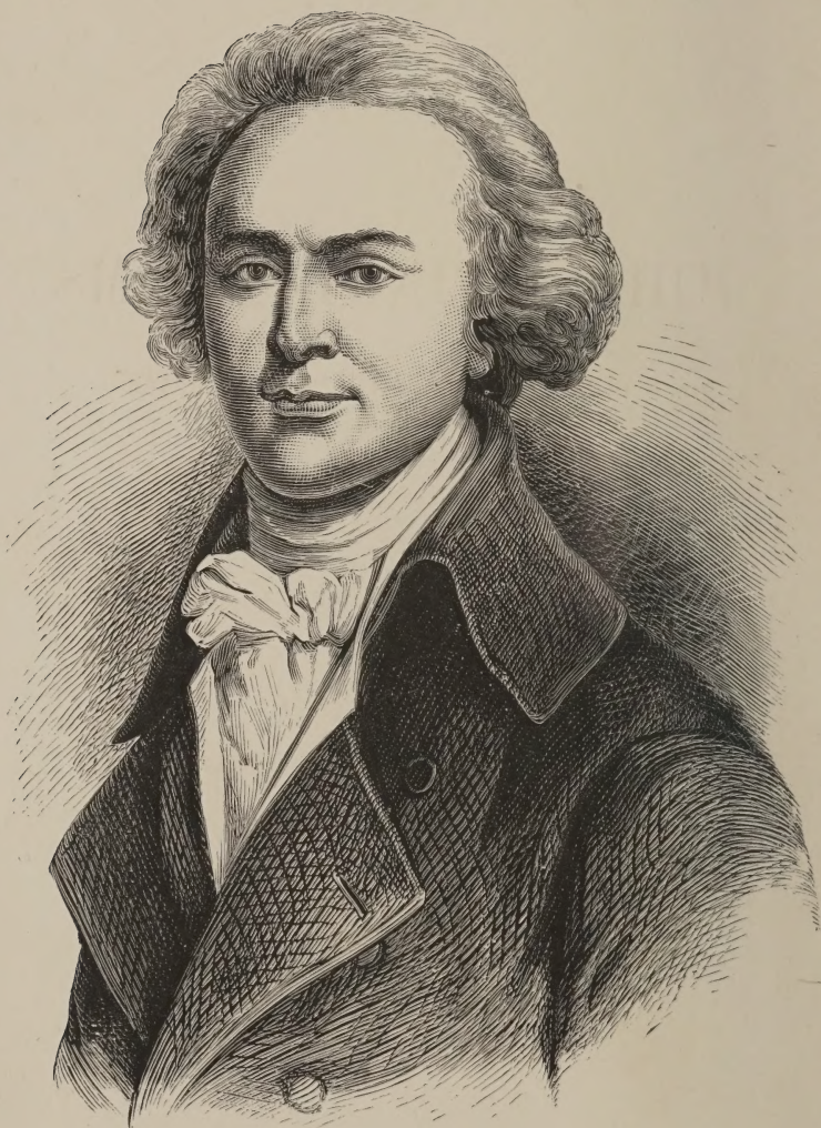
JOHN QUINCY ADAMS. Esq.